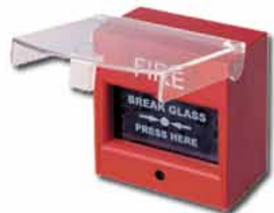
AH-0217 Manual Call Point with clear protection cover is available (Optional)